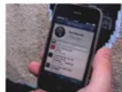
5. SHARE WITH OTHERS