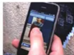
4. BUY SONGS DIRECTLY