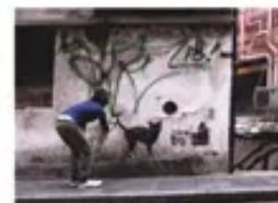
6. KEEP SCANNING TO UNCOVER MORE HIDDEN SOUNDS