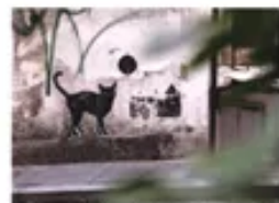
1. DISCOVER HIDDEN ANIMALS WITHIN THE CITY