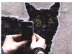
2. SCAN ANYWHERE